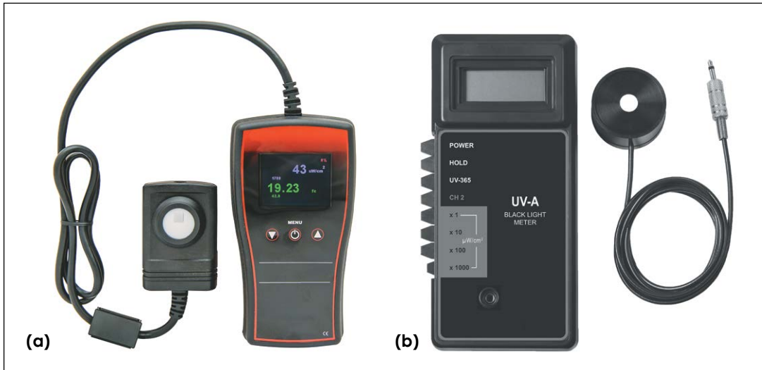
Figure 16. Photoelectric instruments for measurement of UV radiation intensity: (a) dual wavelength radiometer/photometer; and (b) UV meter.

The window lens of the visible radiation (white light) sensor must not fluoresce. Under UV-A of 3500 \mu\text{W}/\text{cm}^2 , visible radiation of 440 \text{ fc} ( 4735 \text{ lx} ) has been reported instead of 1.2 \text{ fc} ( 13 \text{ lx} ) as measured with a photometer with a nonfluorescing sensor window.